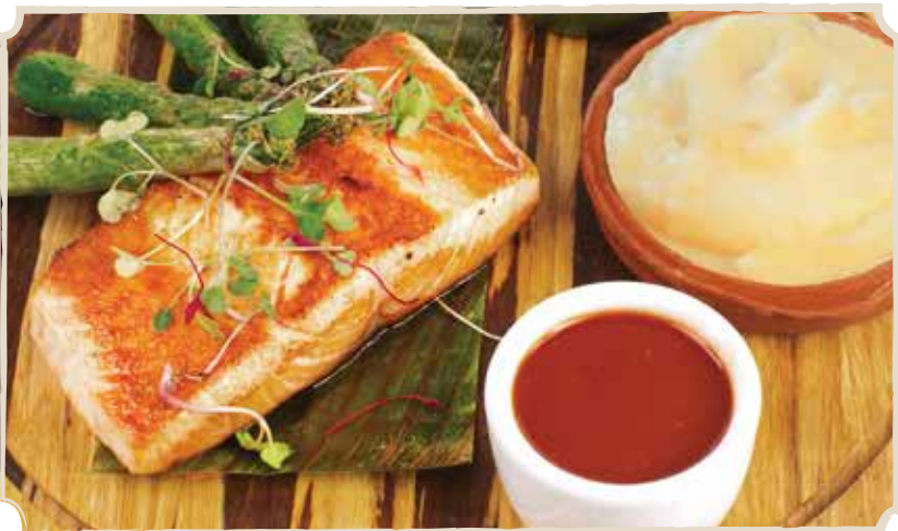
Salmon a la plancha

A sample platter of Havana 1957 Chicken, Ropa Vieja and Lechón. Served with rice, black beans, Salad and Sweet Plantains.