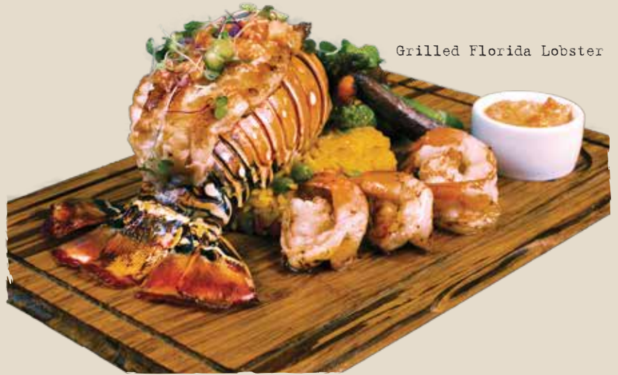
Grilled Florida Lobster

Lobster Tail, grilled jumbo black tiger shrimp, Angus skirt steak. Served with steamed vegetables, yellow rice and 2 special Chef sauces.