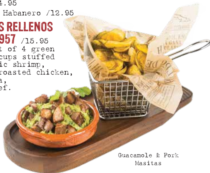
Guacamole & Pork Masitas

TOSTONES RELLENOS HAVANA 1957 /15.95 Assortment of 4 green plantain cups stuffed with garlic shrimp, shredded roasted chicken, ropa vieja, ground beef.